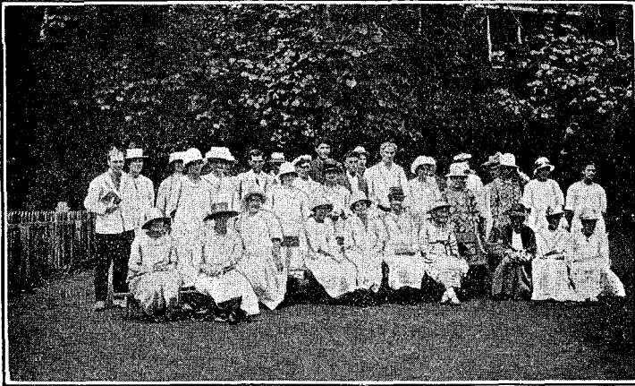
Pitcairn islanders outside their church building.

in disguise. So many missions have lost their way, and instead of carrying out the Gospel commission are concentrating on educational, industrial, medical, or civilizing work.