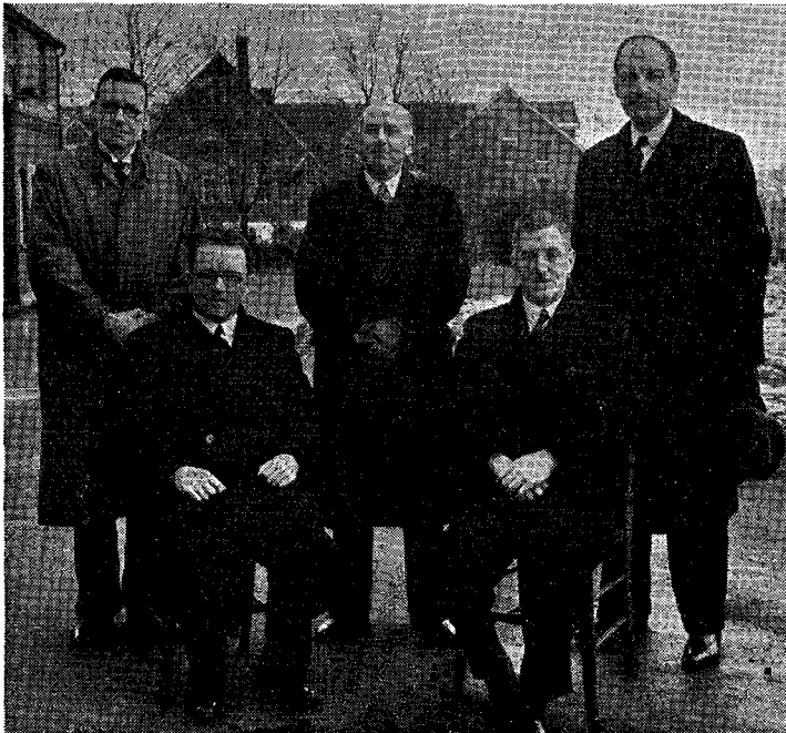
The chairman, manager, and directors of Granose Foods Ltd.