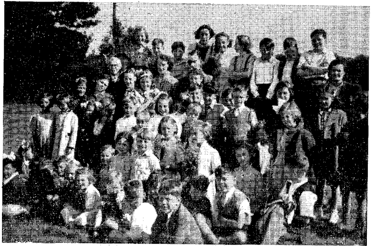
Wallasey Sunday-school children during their summer outing.

It was a long journey to Thurston, our destination, and I think the driver must have lost his way. But all the way along there was non-stop singing.